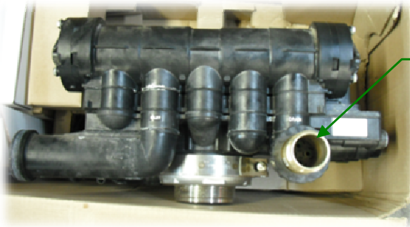
Drain Line Flow Control